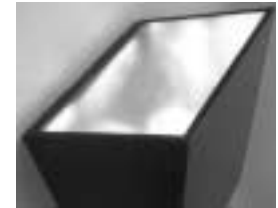
Diffusing glass lens is silicone sealed in canopy to resist moisture and insect infiltration.