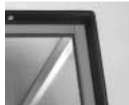
Fixture canopy seals to backplate with quality silicone gasketing.